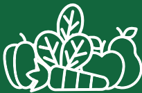
Fruit & Vegetables