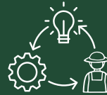
Agri-preneurship Incubation Program